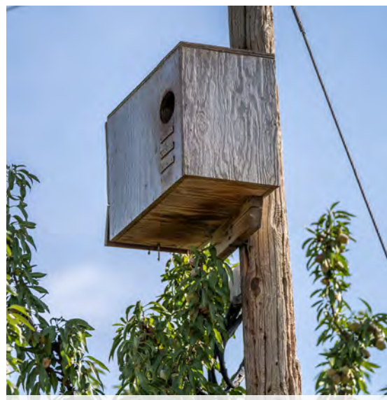
Research shows that owls may prove helpful in managing rodents.

Gopher pressure can be increased by cover crops because the crop biomass provides a food source and may hide gopher signs. The risk of increased rodent pressure is higher in young orchards because rodents can kill young trees. You may choose to limit inclusion of legumes, particularly clovers, because of rodent preference for these species, though site-specific factors will affect rodent population pressure and preference.<sup>5</sup> Careful and consistent monitoring is important, along with proactive control of any emergent gopher problems. Additional strategies, such as owl boxes, show potential as part of a whole-farm management strategy for rodents,<sup>6</sup> and on-farm guidance for their use is available for growers.7