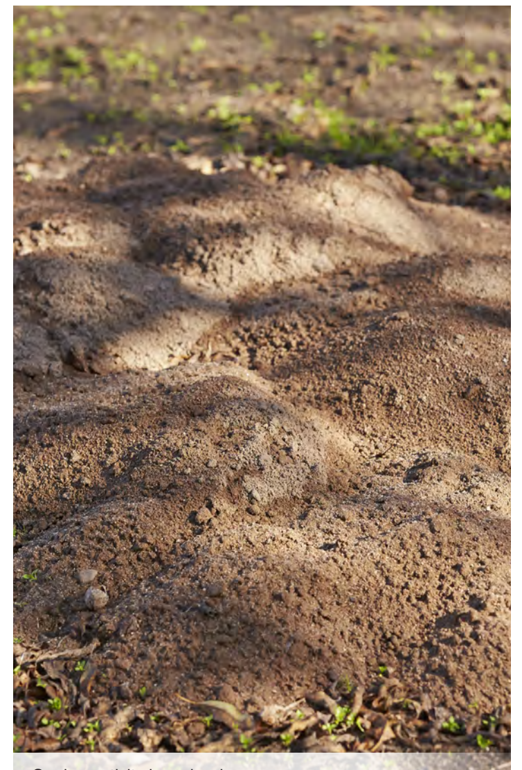
Gopher activity in orchard row.

Pest pressures and pest vulnerabilities of neighboring crops should be considered during the cover crop species selection and management process. Gaining familiarity with Integrated Pest Management (IPM) approaches before implementing cover crops will also facilitate success. Monitoring of pests is also a key aspect to mitigate possible negative effects of cover crops on pest management. This practice allows growers to optimize IPM benefits, such as augmentation of beneficial predators and parasitic insects, which can help control pest populations. The BIOS Manual for Almonds offers additional guidance on cover crops and IPM strategies.<sup>4</sup>