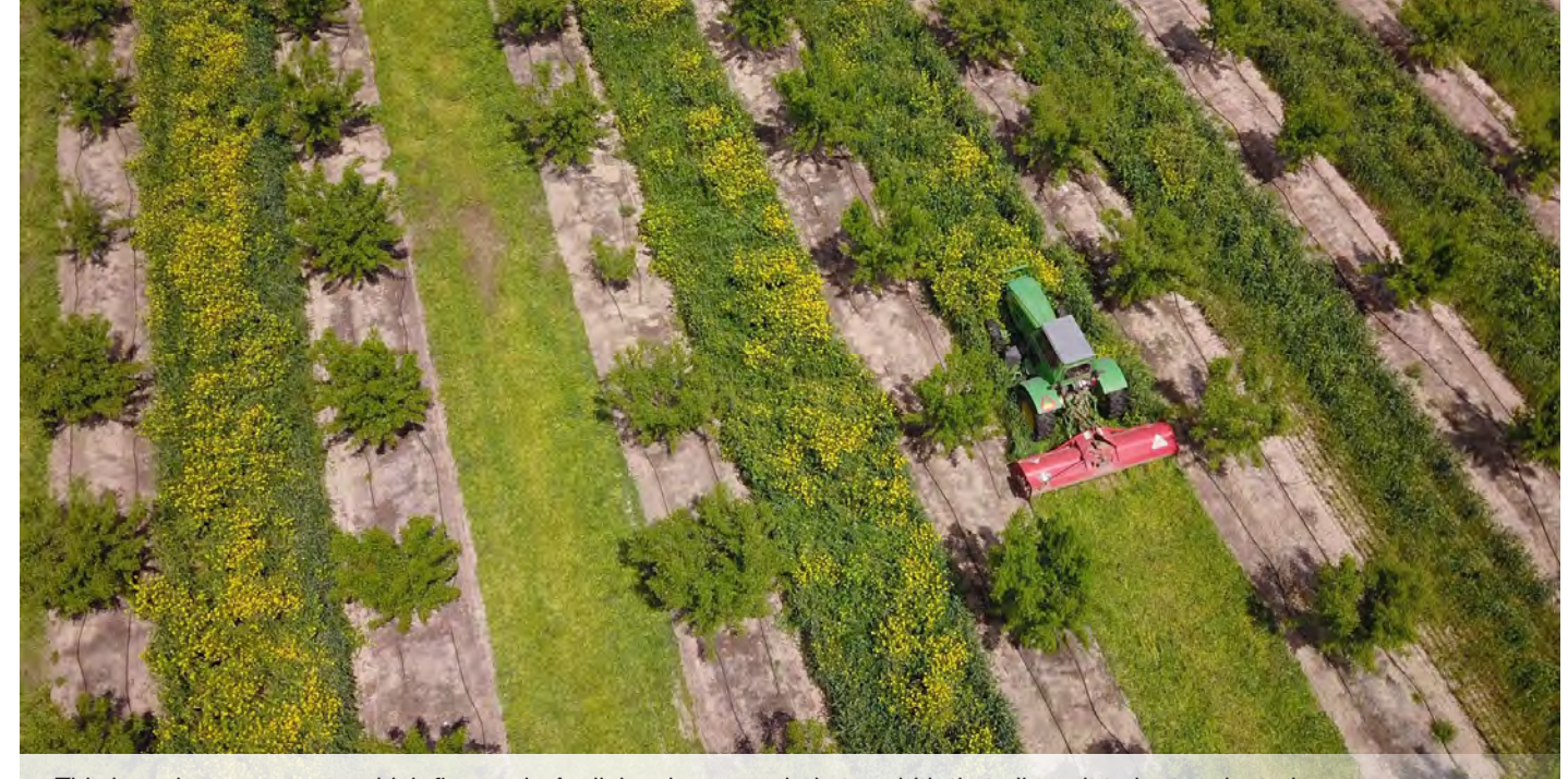
This brassica cover crop, which flowers in April, has been seeded at a width that allows it to be terminated with a single pass of the flail mower.