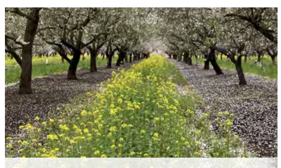
This brassica cover crop in Stanislaus County was broadcast seeded in mid-November and irrigated at the same time as the trees.

Be prepared to adjust your cover crop mix and management to match your goals and experience over the life of your orchard(s).