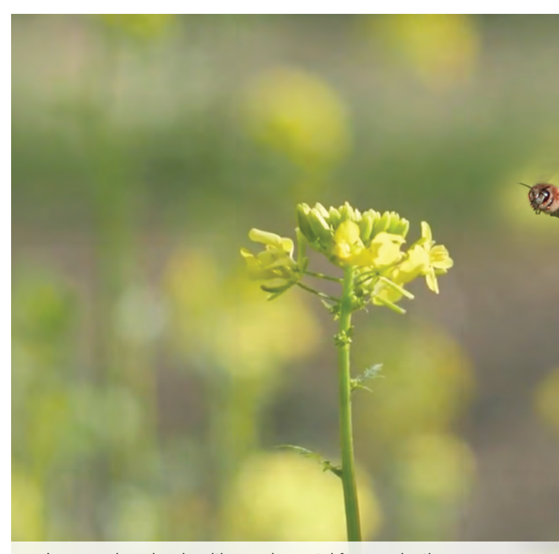
In general, orchards with supplemental forage plantings tend to have higher nut set than those without plantings.<sup>15</sup>

To maximize the presence of beneficial insects and native pollinators, try to provide additional permanent and well-protected habitat so that pollinators and beneficials have somewhere to disperse to when cover crops are mowed.